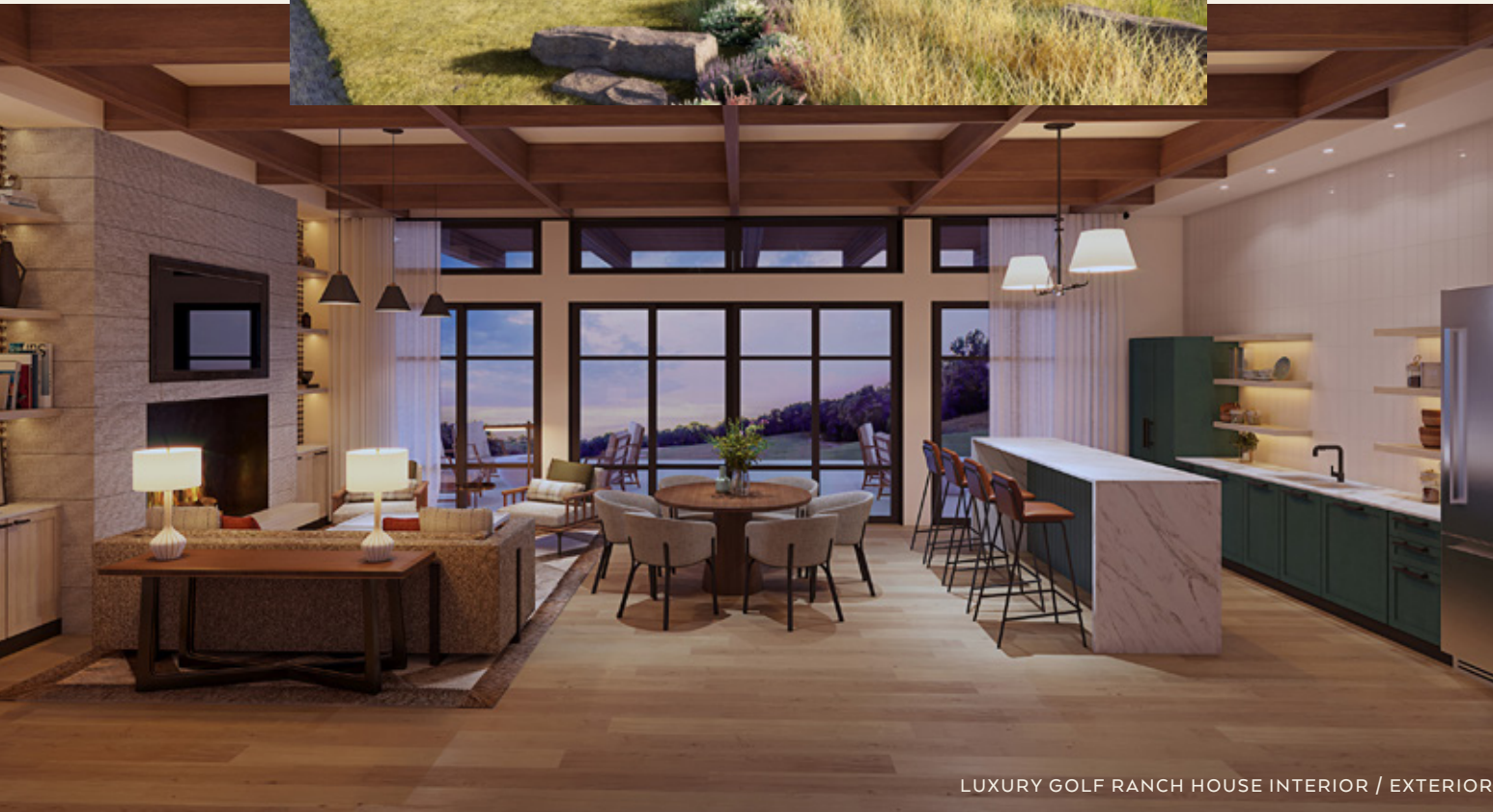
LUXURY GOLF RANCH HOUSE INTERIOR / EXTERIOR