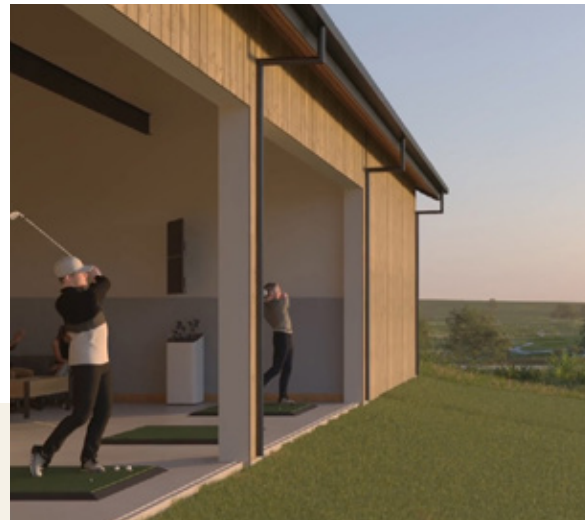
ICE HOUSE HITTING BAYS