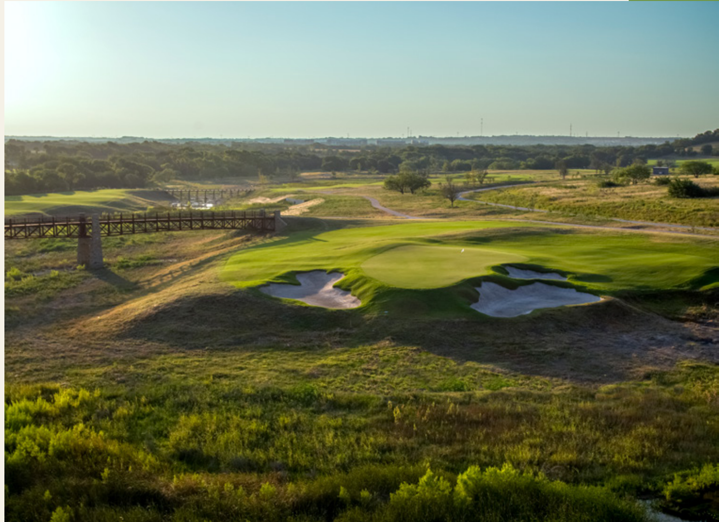
FIELDS RANCH EAST #8

In essence, Fields Ranch East provides strategic variety while incorporating the natural beauty of the property. The result is a championship-level course that will challenge and thrill golfers.