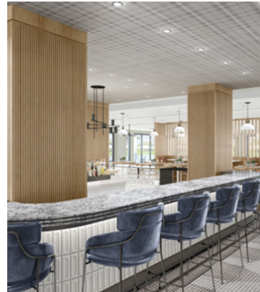
THE APRON KITCHEN + BAR