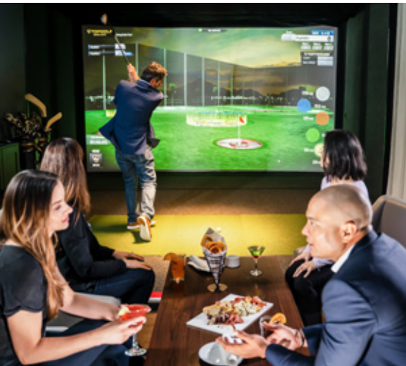
LOUNGE BY TOPGOLF

For golfers and non-golfers alike, the PGA District will serve as a hub that will include several signature dining and retail concepts, programmed entertainment and golf-centered experiences. Guests can take advantage of a tech-driven, coaching and fitting experience at the PGA Coaching Center, play The Swing, par-3, 10-hole short course, and The Dance Floor, 2-acre putting course - both lit for night-play - and more.