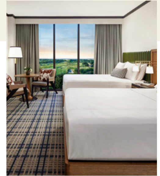
DELUXE DOUBLE QUEEN | 340 SQ. FT.