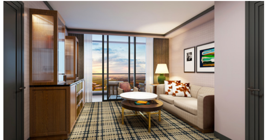
KING BEDROOM SUITE | 562-794 SQ. FT.