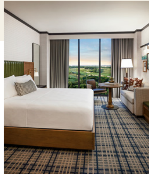
DELUXE KING | 340 SQ. FT.

Each of Omni PGA Frisco Resort's distinctive guest rooms and suites feature subtle nods to Texas culture. These accommodations also offer the ideal retreat in which to rest and marvel at the panoramic views of expansive fairways and lush landscape. Warm tartan patterns are featured on wall coverings and carpets of each thoughtfully designed guest room. Custom designed oak liquor cabinets invite you to enjoy a Ranch Water cocktail, the region's signature cocktail from the comfort of your hotel room.